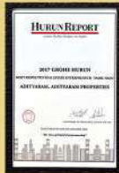
“ MOST RESPECTED REAL ESTATE ENTREPRENEUR ” – BY HURUN REPORT – 2017