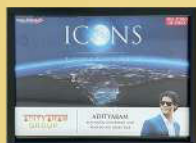
“ ICON OF TAMILNADU ” – BY EDUCATION MINISTER, GOVT OF TAMILNADU – 2021