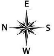
ADITYARAM PALACE CITY PARADISE