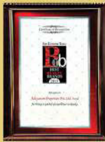
“ THE BEST REALTY BRAND ” – BY THE ECONOMIC TIMES – 2015